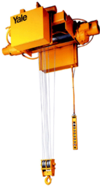
Left: The Cable King Wire Rope Hoist

The Yale electric hoist is famous for its durability. Dearborn Overhead Crane has been supplying Yale hoists for year, to important customers such as Toyota. Yale's primary product line is the Cable King electric hoist, in production for over forty years. The Cable King electric hoist is a wire rope hoist with a mechanical loadbrake. Although the Cable King electric hoist is a pricey product, the performance and durability are legendary. Yale also features the Global King wire rope hoist. The Global King is a modern hoist introduced in 2000, and is noted for it's regenerative secondary hoist brake. The regenerative secondary hoist brake takes the place of the mechanical load brake, allowing the hoist to have less moving parts for longer service life. The Cable King wire rope hoist and Global King wire rope hoist are available in base mount, double-girder, and single-girder application. Dearborn Overhead Crane can customize your Yale wire rope hoist to fit a special application, such a low headroom, high speed, or use of under-hook fitting or device.