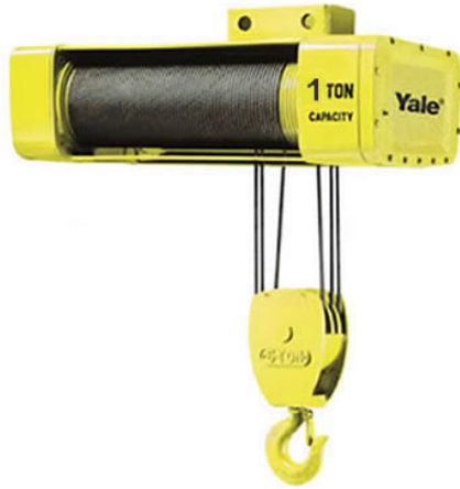
Left: The Y80 Wire Rope Hoist