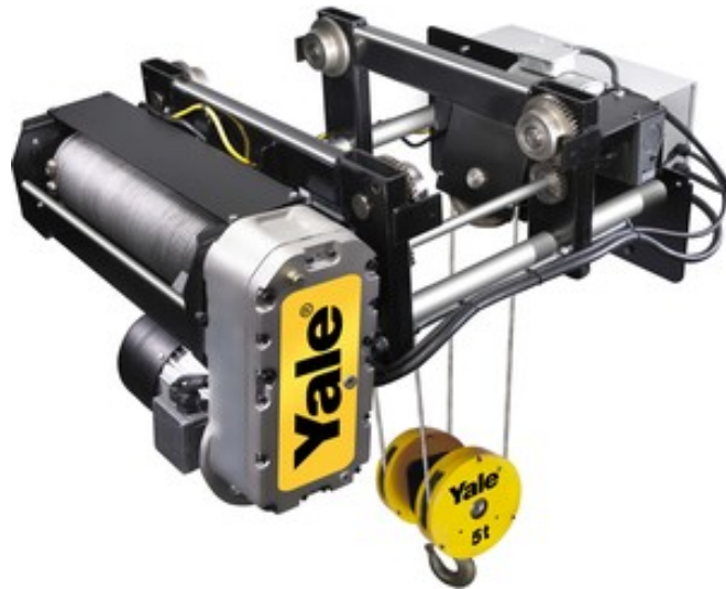
Right: The Global King Wire Rope Hoist